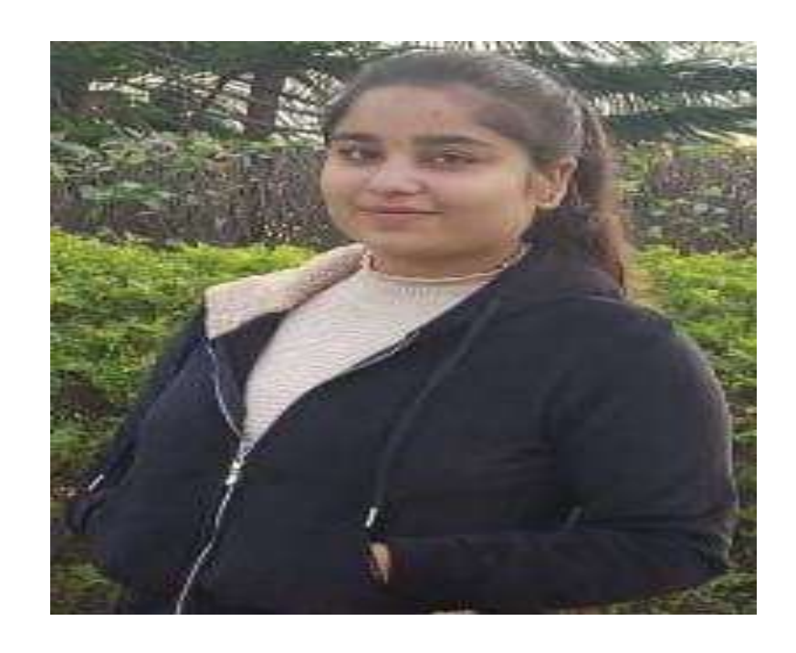
PARKHI BBA 1 B